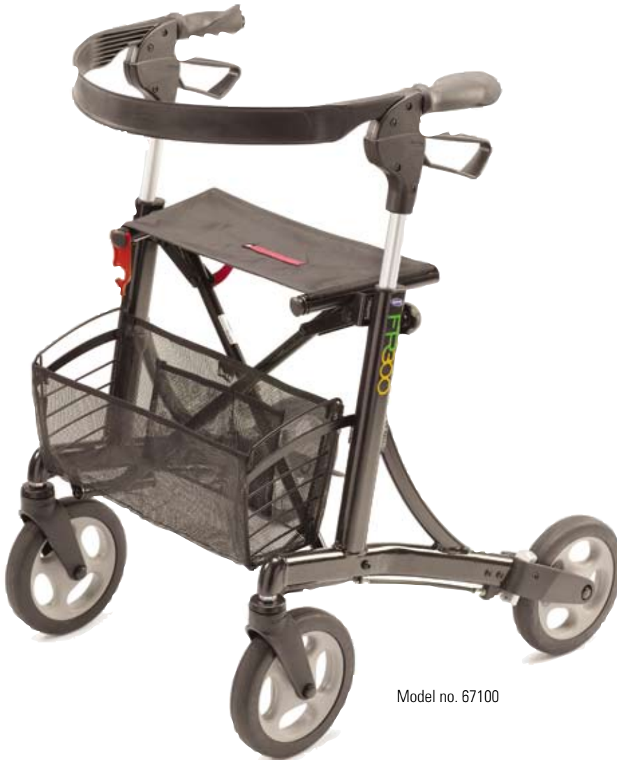
Model no. 67100